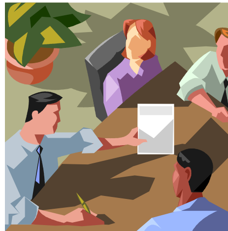
Board Meeting 2/21/2012